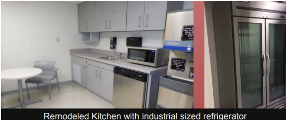
Remodeled Kitchen with industrial sized refrigerator