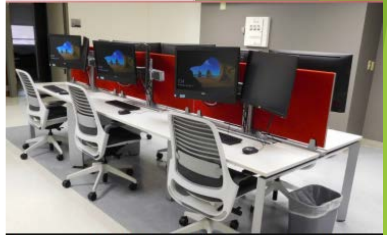
Common Work Area with 6 computer stations